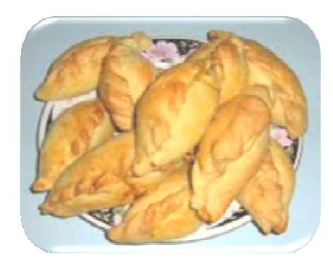
Trakai specialties "Kibinai"