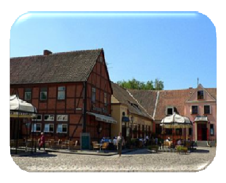
Klaipėda Old Town