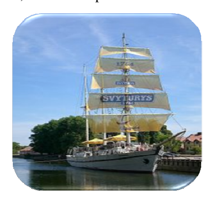
Sailing boat "Meridianas"

Klaipėda is the third largest city in Lithuania and the only sea-port of the country. Originally founded by Baltic tribes, the city was built by the Teotonic Order in 1252 and named Memel after a river 40 kilometers south. For most of its history, Klaipeda, was part of Prussia and later Germany before falling into Lithuanian hands after the First World War. The German heritage is still highly visible, but the sea-port status has seen the city blooming on its own.