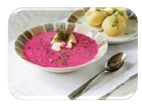
Cold red beet soup "Šaltibarščiai"