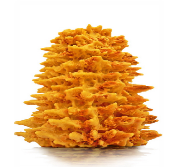
Wedding cake "Šakotis"